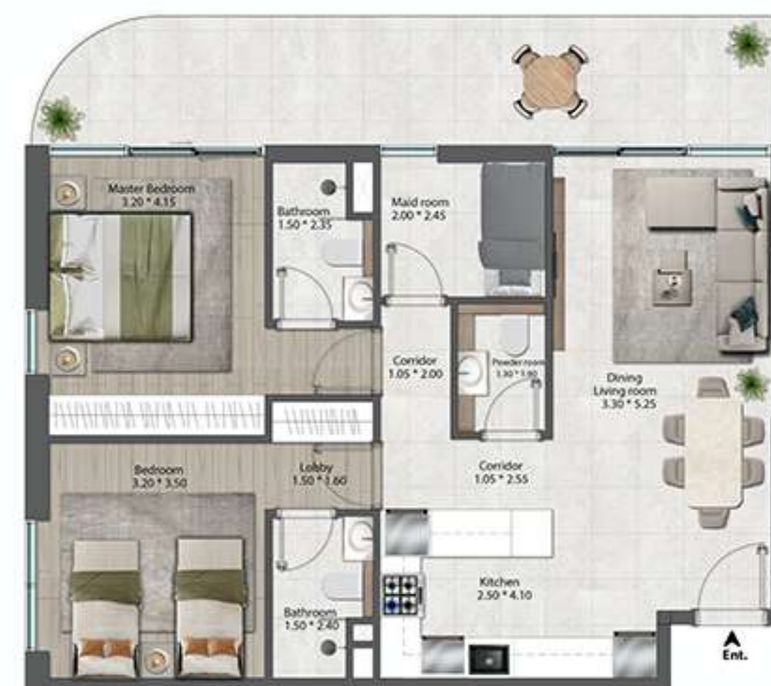
2BR - MAID ROOM