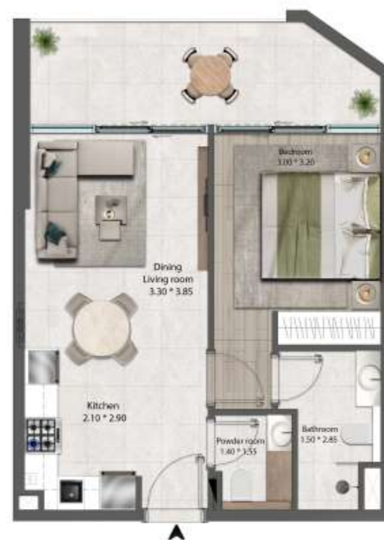
1 BEDROOM (584-746 SQFT)