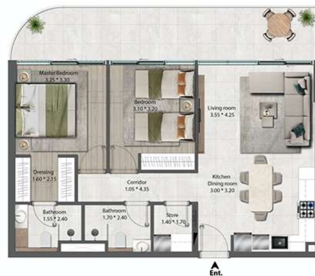
2BR - STORE ROOM