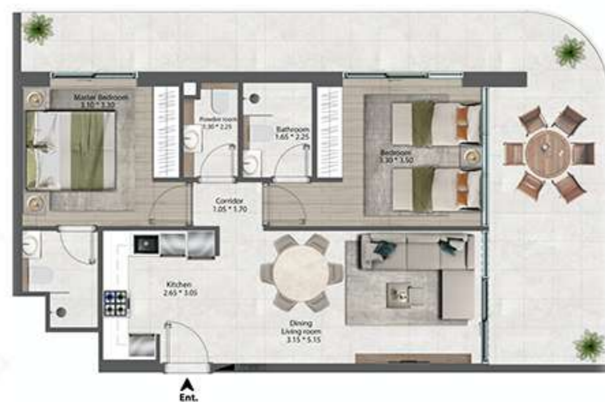
2BR - POWDER ROOM