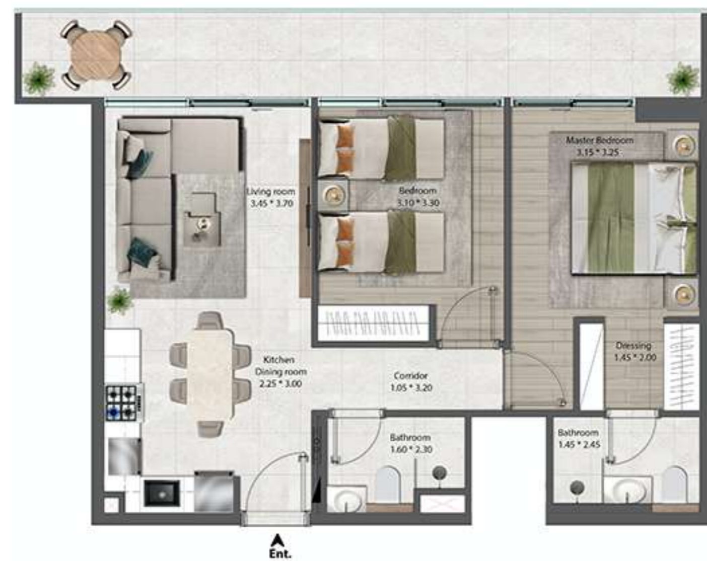
2BR - TYPICAL