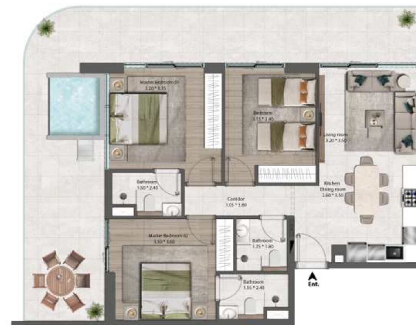
3 BEDROOM (2101-2564 SQFT)