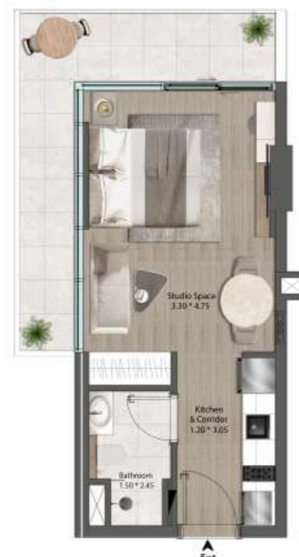
STUDIO (423-441 SQFT)